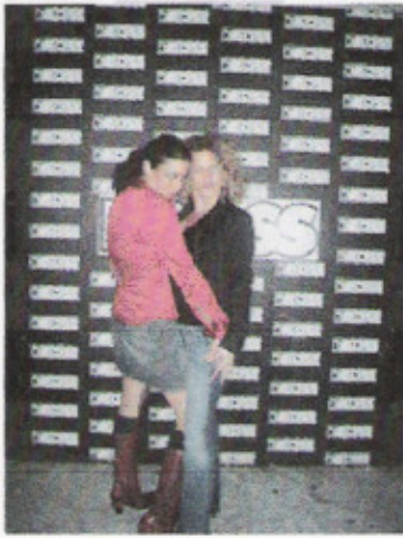
A little sexy for meatchop.